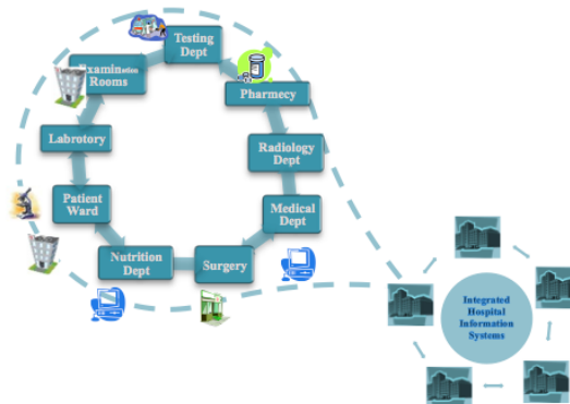
Figure 3. Integrated HIS

Information systems are essential for managing processes in hospital departments. To access information across hospital departments and between hospitals, integration of these information systems is necessary (See Figure 3).