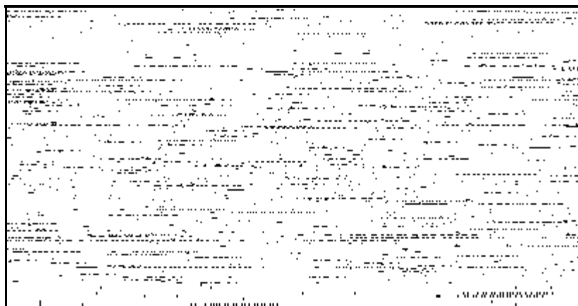
Figure 1: Constitutive elements of effective WWW learning environments

Learning is a process that is influenced by, and results from, the interaction of three areas of influence: agent, activity, and world (Lave & Wenger, 1991) Other writers, for example, Brofenbrenner (1979) provides similar descriptions for these influences such as person, process and context approach (as cited in Ceci & Ruiz, 1993). In terms of the instructional design for interactive multimedia programs, we have found a framework of three mutually constitutive elements: the learner, the implementation and the interactive multimedia program to be useful in describing the roles and responsibilities within the learning process. The three elements correspond to the role of the teacher, learner and the materials themselves, in the instructional setting. When this framework is applied to the design of WWW multimedia materials, key factors and strategies for each of the elements can be identified (Figure 1). While the factors for learner and implementation are quite consistent with other interactive media, within the WWW materials there are a number of important and unique attributes that can be considered.