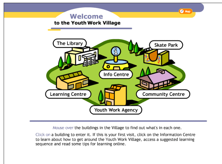
Figure 2: The Youthwork online learning setting ( www.international.holmesglen.vic.edu.au/tds/youthwork/home.htm )

the quality of the product that is developed. Each unit is based around completion of a large anchoring task which has been chosen to reflect realistic and workplace activities. In this setting, the learner assumes the role of a worker and undertakes the tasks in the virtual workplace setting provided by the environment.