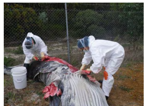
Figure 3: Post-mortem examination of a humpback whale calf. (removing blubber)