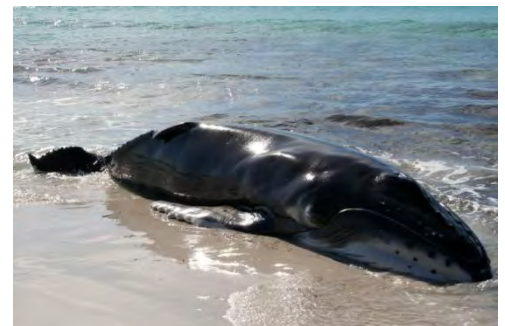
Figure 2: Stranded humpback whale calf