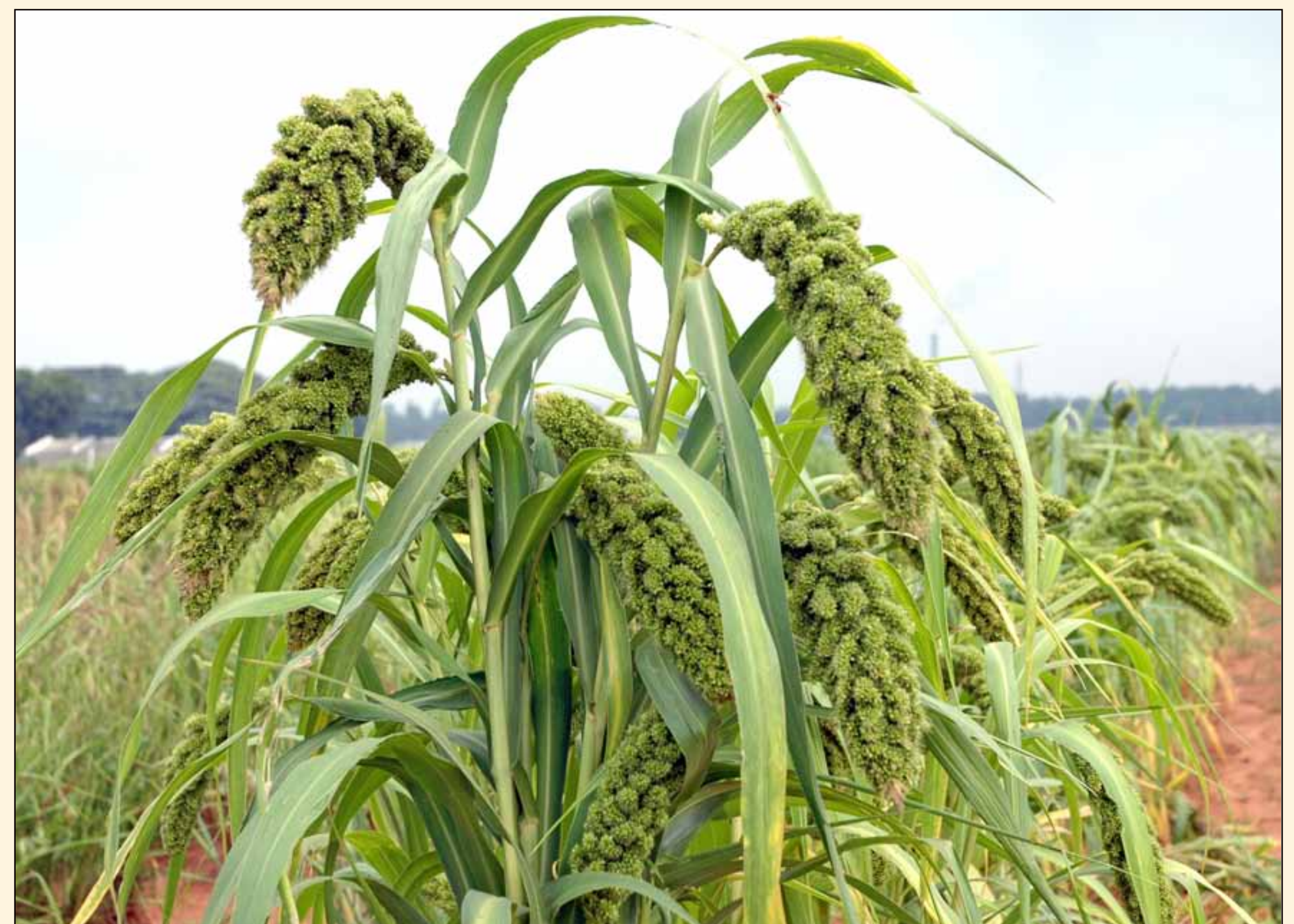
Regeneration of foxtail millet germplasm.