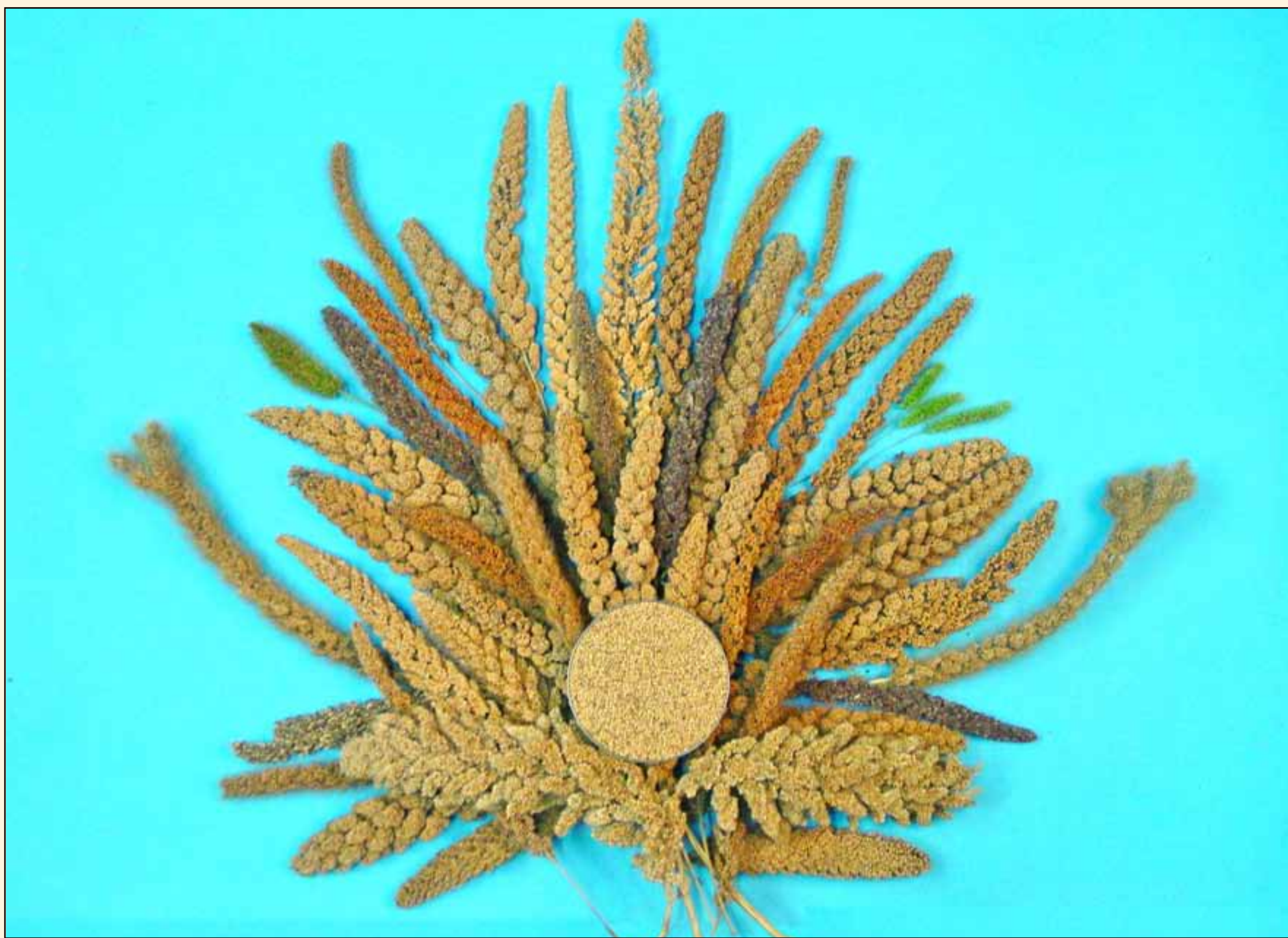
Diversity in foxtail millet germplasm.