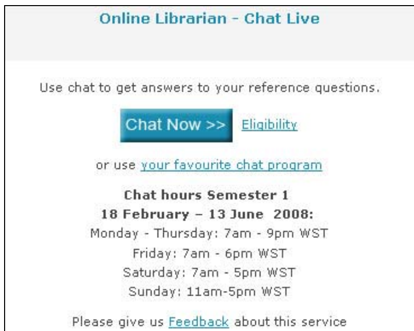
Figure 3: Murdoch University Library's Online Librarian webpage