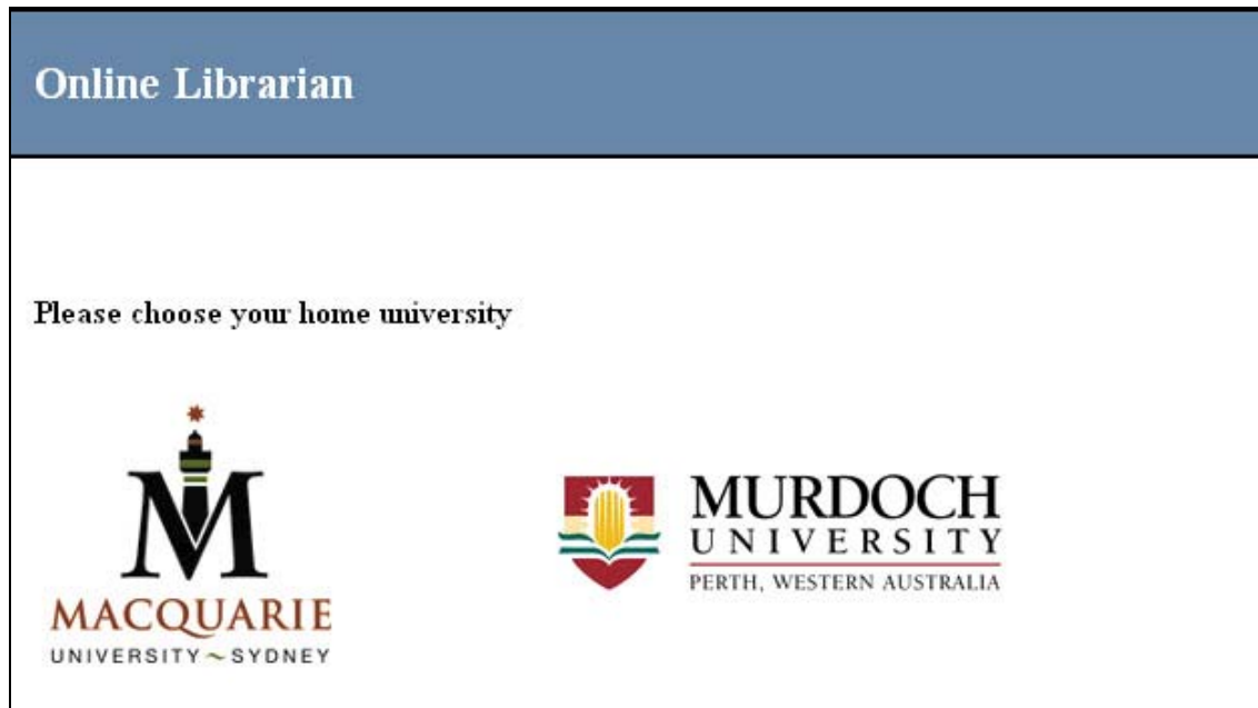
Figure 2: The MAMS WAYF (Where Are You From) page

Step 8: Automate the production of basic operating statistics – number of calls from each university’s patrons; number of calls answered by operators from each university; the time of day of calls; and the number of message transactions in each call.