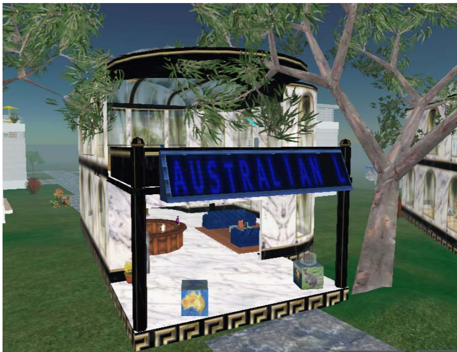
IMAGE 1 – Australian Libraries Building in Second Life, Cybrary City 211, 70, 24

Second Life started in 2003, and there were early library services by January 2005. The Alliance Library System, a consortium of around 260 libraries in Illinois in the United States, started their Second Life Library 2.0 project in April 2006 in a small rented shop front. By September 2007, this project had grown to over forty affiliated islands in the “Information Archipelago”. Library activities centre on Info Island, which receives over 6000 visitors a day. The Australian Libraries Building is a two-storey granite building, surrounded by Eucalyptus trees, on Cybrary City, one of the islands in the Information Archipelago. It is at coordinates 211, 70, 24.