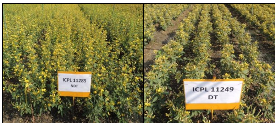
Figure 3. Super early pigeonpea

1) Sole crop . About 20% of farmers prefer sole crop of pigeonpea particularly in sandy loams and medium to heavy clay soils. Under intensive cultivation with better adoption of integrated crop management technologies farmers are realizing 2 t ha -1 to 2.5 t ha -1 . This system also created avenues for innovative interventions like transplanting (with drip irrigation) by which the full exploitation of genetic yield potential (up to 4 t ha -1 ) of the varieties and hybrids was achieved.