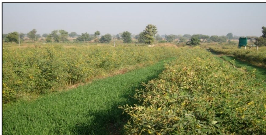
Figure 1. Pigeonpea + soybean followed by wheat (after harvesting soybean rows)