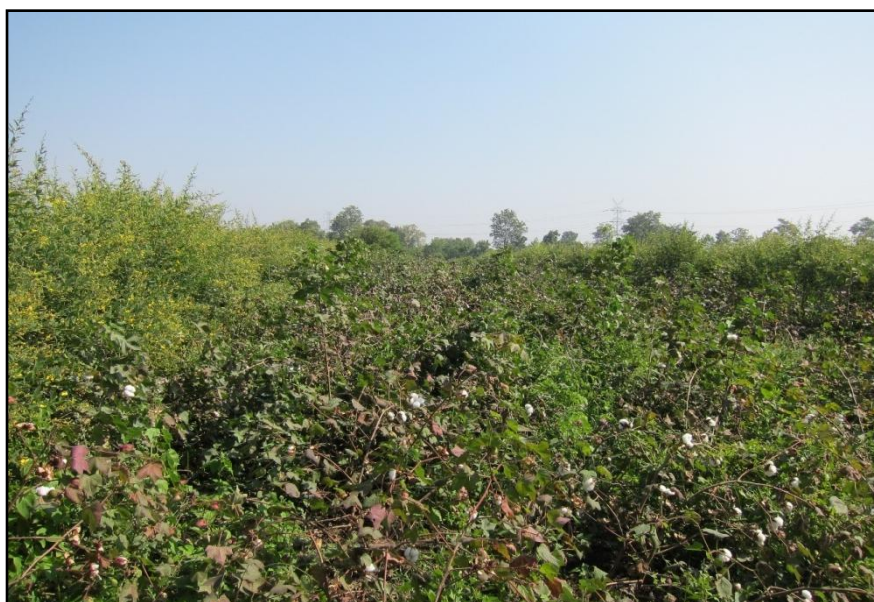
Figure 2. Cotton + pigeonpea intercropping system (10:1 ratio)