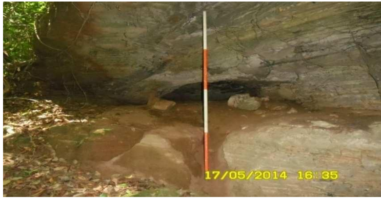
Plate 4: Showing the mini cave

Affa waterfall has a co-ordinate of 06^{\circ} 33^{\circ} 55.1 N and 07^{\circ} 26^{\circ} 19.4 and a height of 316 (10ft) meters above sea level. It has two cavities that formed a circle. The overall enclosure of the Affia waterfall is 5250cm meters, while the first cavity is 1170cm and the second, 390cm. The second cavity is the source of the waterfall and the ripples drop heavily. According to one of the informants, the cavities housed dangerous animals like crocodile, python, hyena etc. The site is a beauty to behold and eco-tourists in need of alluring attractions will really appreciate the serenity and features of the site.