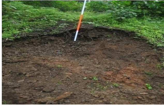
Plate 1: Sowing the slag heap

The cave and natural bridge are found in Amaagu village in Ibite-Okpatu. Oral tradition has it that the Affia stream, which extends to the waterfall and subsequently to Adada River (as presumed by the locals), supplied the people with water prior to the advent of water tankers and bore-holes. The source of the waterfall/stream was traced to “Ugwureregwu”, the tallest hill in the area.