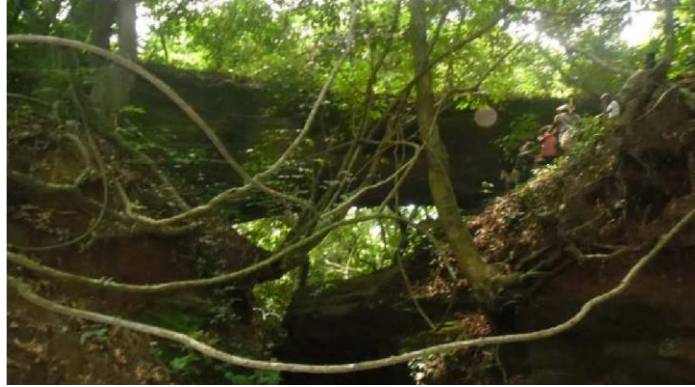
Plate 3: Showing the natural bridge

level. It is a big bridge with a thickness of 214cm, and a width of 870cm. It has naturally-shaped heavy boulders in the form of pillars as support; beneath one of which is a mini cave, which some people see as a rockshelter.