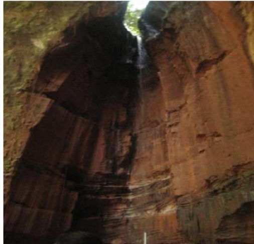
Plate 5a: Showing the source of the waterfall

Affa waterfall has a co-ordinate of 06^{\circ} 33^{\circ} 55.1 N and 07^{\circ} 26^{\circ} 19.4 and a height of 316 (10ft) meters above sea level. It has two cavities that formed a circle. The overall enclosure of the Affia waterfall is 5250cm meters, while the first cavity is 1170cm and the second, 390cm. The second cavity is the source of the waterfall and the ripples drop heavily. According to one of the informants, the cavities housed dangerous animals like crocodile, python, hyena etc. The site is a beauty to behold and eco-tourists in need of alluring attractions will really appreciate the serenity and features of the site.