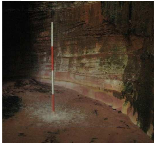
Plate 5b: Showing the water ripples