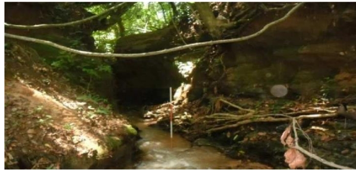
Plate 2: Affia Stream flowing from Ugwureregwu down to the waterfall

The cave and natural bridge are found in Amaagu village in Ibite-Okpatu. Oral tradition has it that the Affia stream, which extends to the waterfall and subsequently to Adada River (as presumed by the locals), supplied the people with water prior to the advent of water tankers and bore-holes. The source of the waterfall/stream was traced to “Ugwureregwu”, the tallest hill in the area.