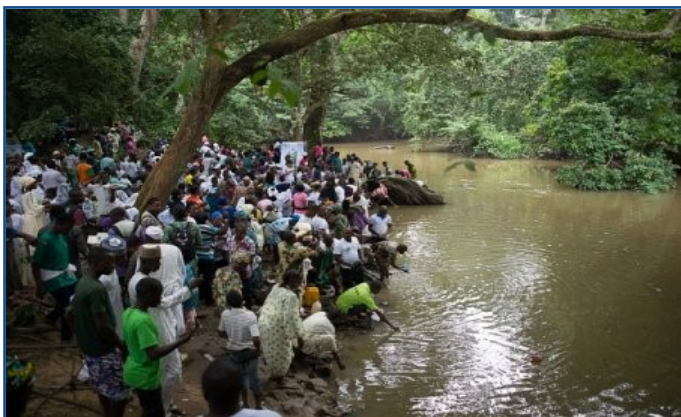
Plate 2: Osun Festival