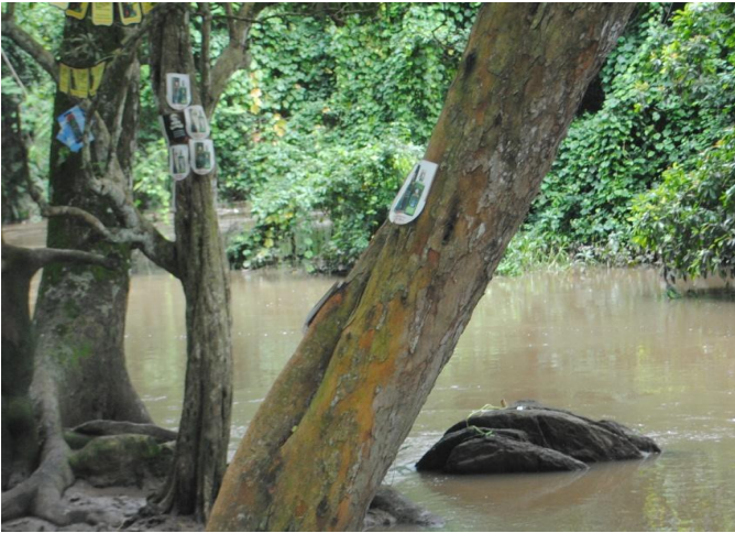
Plate 1: Osun River