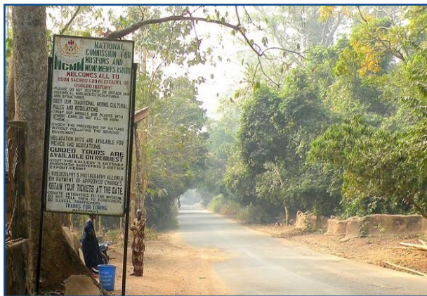
Plate 3: Tarred and Untarred Roads Leading to the Osun Oshogbo Grove