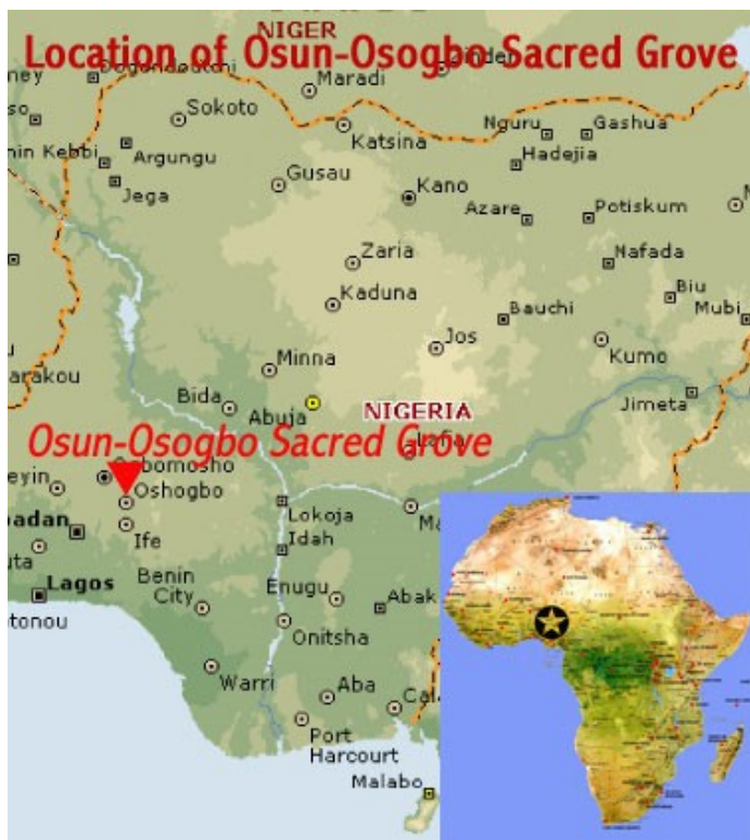
Figure 2: Osun Osogbo Neighbouring Towns / Routes