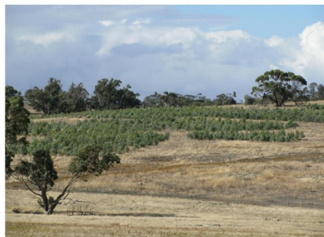
Figure 2 Ridgefield before (2 August 2010) and after (17 April 2012) planting to restore multiple functions.