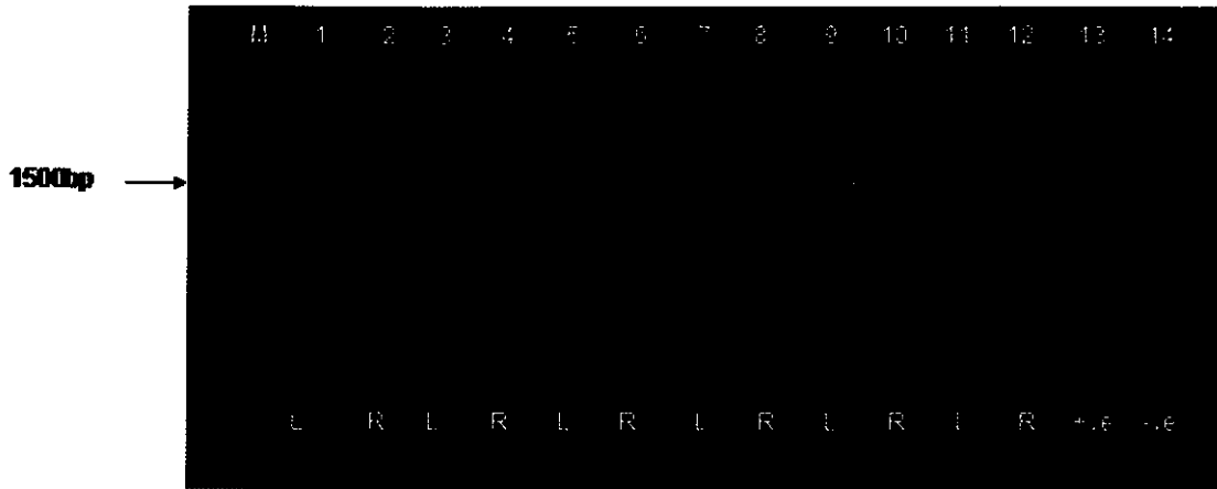
Figure 3. 1% agarose gel showing PCR products amplified from sample tissues collected from Kings Park and Botanic Garden. M = 100bp ladder (Promega). L = Leaf tissue. R = Root tissue. Lanes 1-4, A. saligna : Lanes 5-12, A. fraseriana : Lane 13, PCR positive control (SPLL): Lane 14, PCR negative control.