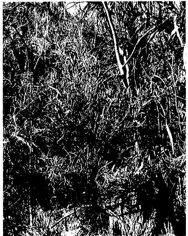
Figure 2. Diseased A. saligna tree in Kings Park with phytoplasma-like symptoms such as little leaf, stunted bushy growth, and witches' broom (September, 2006).