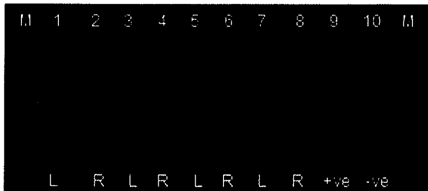
Figure 5. 1% agarose gel showing PCR products amplified from asymptomatic tree samples collected from the Banksia Reserve, Murdoch University. M = 1Kb ladder (Promega). L = Leaf tissue. R = Root tissue. Lanes 1-4, A. fraseriana : Lanes 5-8, A. saligna : Lane 9, PCR positive control: Lane 10, PCR negative control.

roots and leaves were reported as one sequence and 1368 bases were submitted in GenBank (accession no EF474451). Similarly partial sequences from A. saligna were compared and combined as one sequence and 1362 bases were submitted to GenBank (accession no EF474452). Partial sequence data of 1353 bases from asymptomatic A. fraseriana roots from the Banksia Reserve, Murdoch University were also submitted in