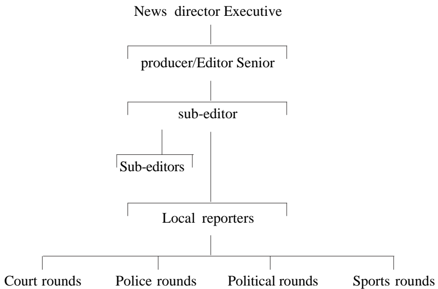
Figure 2: 720 ABC Radio newsroom structure

The diagram shows a clearly defined structure with the locus of power residing with the news director, who is responsible for the daily running of newsroom operations as well as making any crucial news decisions. The executive producer or editor keeps track of all the daily prospects or local stories that flow into the newsroom, and may make decisions on which local stories reporters are to cover. The ABC is the only media organisation that employs sub-editors for the sole purpose of checking all facts before news bulletins are broadcast. On-the-ground news-gathering is done by local reporters working in general news, and also in specialised areas including police rounds, political rounds, court rounds and local sports. Although newsroom personnel are assigned specific roles, they are also multi-skilled, and may thus work in other areas if required to do so.