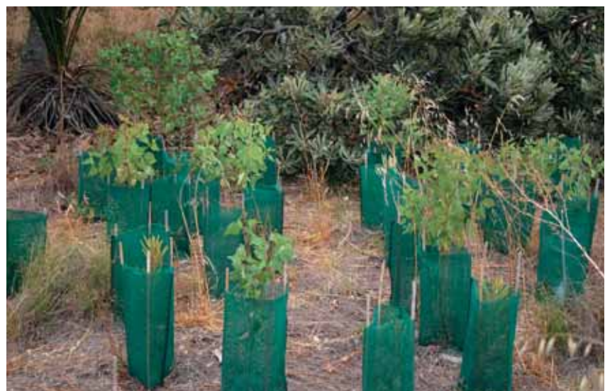
Successful restoration of tuart using shade-cloth tree guards.