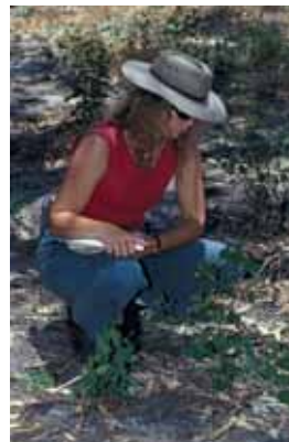
Monitoring of seedling survival.