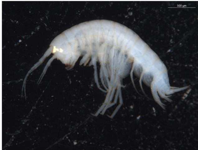
Figure 3. Undescribed species of stygobitic Neoniphargidae, Amphipoda, collected from the aquifer in Mitchell Park, South Australia.

groundwater and/or on the stygofauna. This suggests that some “hitch-hiking” prokaryotes may be opportunistic rather than niche specific.