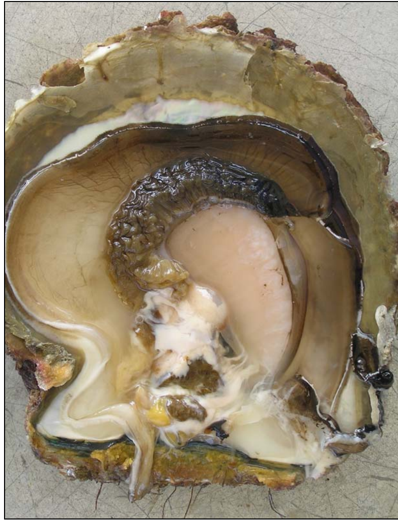
Picture: An adult pearl oyster.