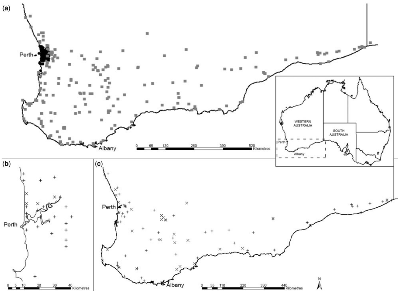
Figure 1. Collection locations of dugite P. affinis specimens used for this study: a) urban specimens (around the Perth metropolitan area where human population density exceeded 500 persons·km 2 at the time of the nearest Australian Bureau of Statistics census) are indicated by black dots, non-urban specimens are shown with grey squares; distribution of dugites containing prey in gut contents for b) urban and c) non-urban specimens. Legend: cross—non-native rodents; diamond—native rodents; plus—reptiles. Study location with reference to the wider Australian continent is shown in center right.

where there have been local prey extinctions recorded as a result of predation pressure (Savidge 1988). By contrast, P. sebae in suburban areas in Nigeria supplement their diet with synanthropic rats and domesticated poultry, but are significantly smaller than conspecifics from non-urban environments: the authors did not suggest any reason for this difference (Luiselli et al. 2001). In the present study, we investigate the effect of urbanization on the feeding ecology of the dugite Pseudonaja affinis , Elapidae (Günther 1872). This species is one of the most common snakes of south-west Western Australia, thriving in woodlands, heaths, and urban environments (Chapman and Dell 1985), possibly via supplementation from the spread of the invasive house mouse Mus musculus (Shine 1989). Although the house mouse is a small species, it is larger than the majority of urban lizards in Western Australia (How and Dell 2000), and its communal nesting and prolific breeding (e.g., Gomez et al. 2008; Vadell et al. 2010) appears to provide dugites with frequent opportunities to eat multiple individuals (and therefore larger meals). Dugites are regarded as one of the best urban-adapted large-bodied reptiles in Australia (How and Dell 1993), which makes them ideal model animals for urban/non-urban comparisons. Assuming dugites benefit from the presence of synanthropic rodents, then we make the