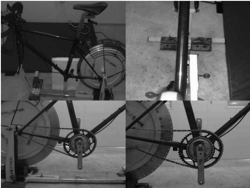
Figure 1 — Guard used to limit participant visibility of chainring (top-right and top-left) and orientation of the elliptical chainring in the elliptical 1 (bottom-left) and elliptical 2 (bottom-right) settings.

The initial 10 km time trial was completed using a standard circular chainring (53 tooth; Durace, Shimano, Japan) and was used for familiarization purposes; therefore, this data was not included in the analysis. The remaining three time trials were conducted in a counterbalanced order using one of three chainring configurations (normal, elliptical 1 , or elliptical 2 ; Figure 1). The elliptical chainring used during