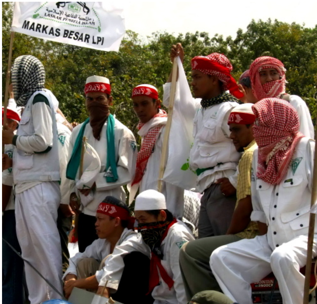
Members of the laskar militia division of Front Pembela Islam