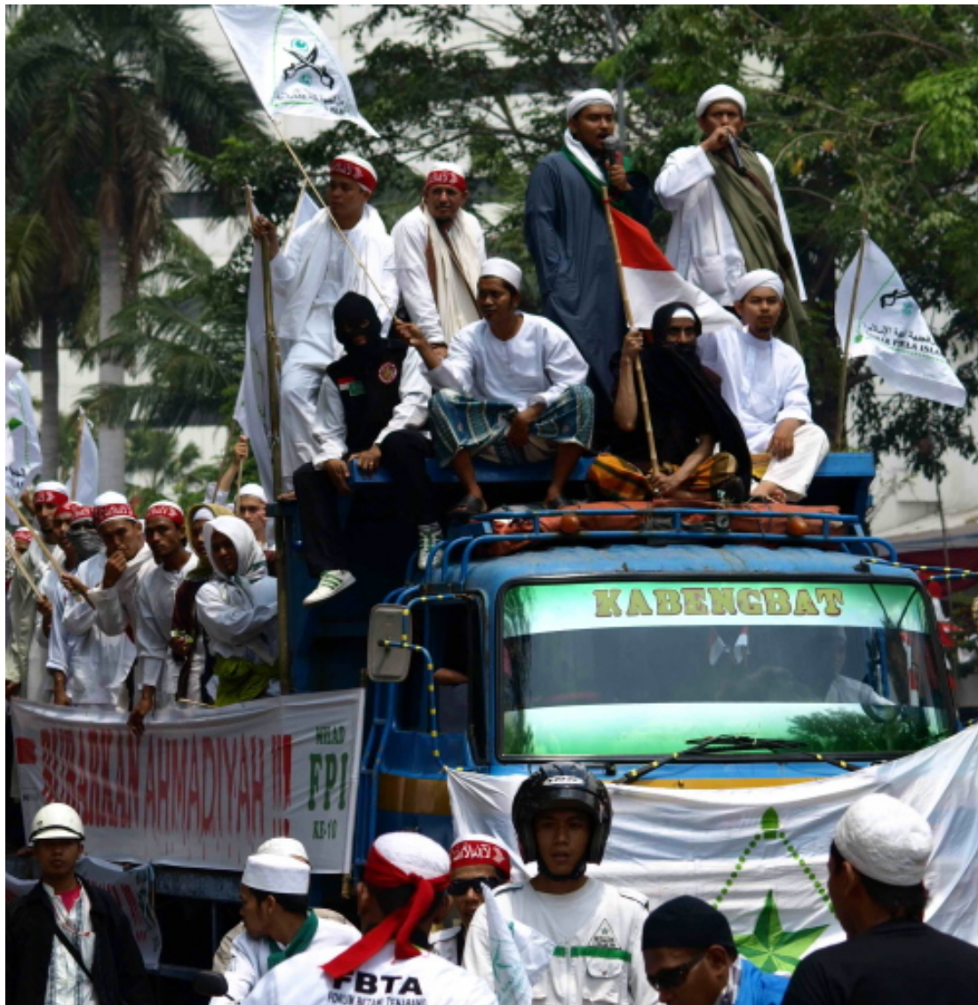
A protest by the Front Pembela Islam demanding the outlawing of the Ahmadiyah sect, Jakarta 2008.

access to a network of solidarity and back-up when faced with rivals, competitors or resistance from locals to the imposition of protection. 13 Like the methods for instant kebal , this has become a relatively easy way of establishing and monopolising a local territorial domain, a space in which jago ‘honour’ and masculinity can be performed. The group name also acts as a deterrent to sanction from local police, who are generally reluctant to confront those groups with a large membership (Interview with police officer, Jakarta 2007).