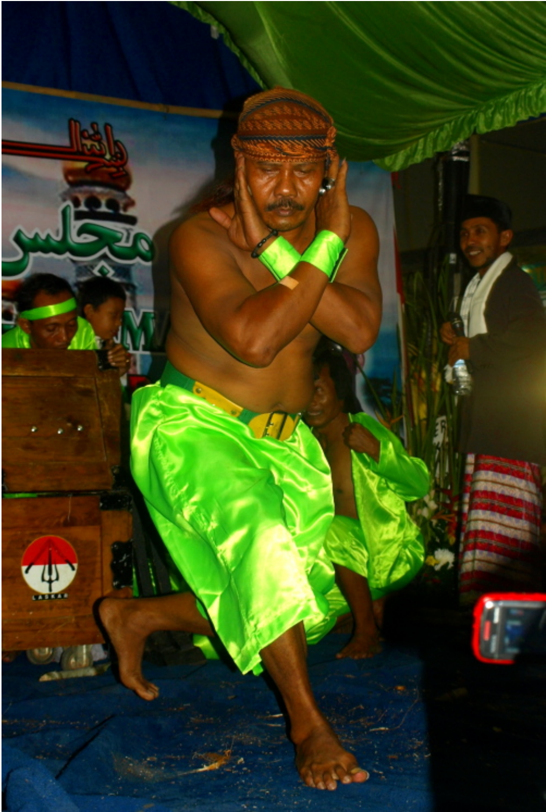
A demonstration of 'inner power' martial arts at a gathering of the Betawi Brotherhood Forum in Jakarta, 2009.