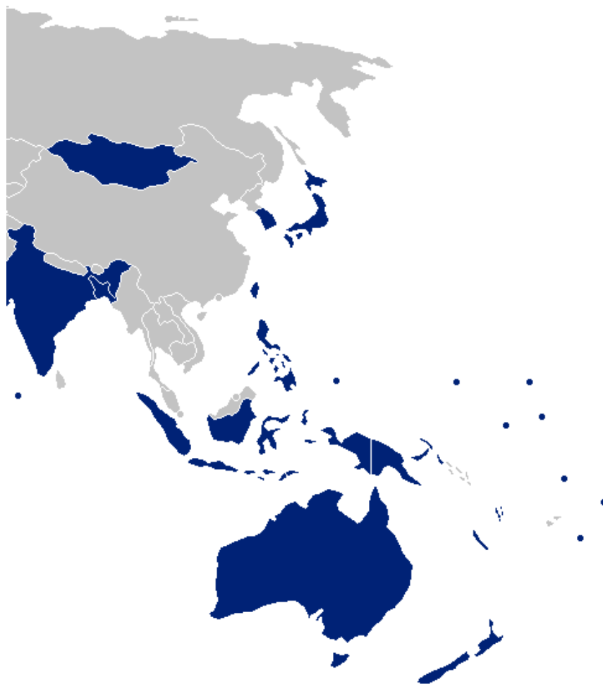
Fig 1: “Electoral Democracies” in East Asia

The fact that this relationship has now been stable for a decade suggests that this is not just a temporary phenomenon but has deeper causal roots. Only Thailand has shifted its basic regime type from democracy to non-democratic in this century.