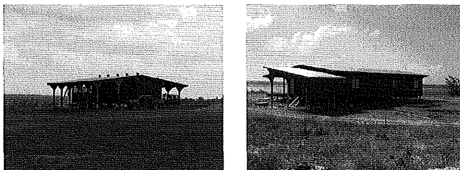
FIG. 2: BUNK HOUSE AT GARRATHIYA AND LIVING QUARTERS IN DHANAYA