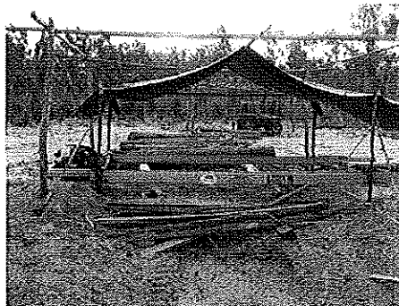
FIG. 1: TIMBER MILLING NEAR GARRATHIYA

Based on a Memorandum of Understanding between the project partners, Forestry Tasmania staff provided training to local community members and offered instruction in the cutting and processing of timber while the Architectural School of the University of Tasmania Construction made available architectural drawings and milled timber lists for the accommodation to be built by local Yulgnus. Beyond financial support, links to government facilitated logistical support and reductions in red tape, and Fairbrother representatives oversaw building construction. Local hardwoods were cut and processed on site in the forested areas south of Nhulunbuy using a mobile Lucas mill (see Fig. 1). The milled timber was then transported to different locations to commence building construction.