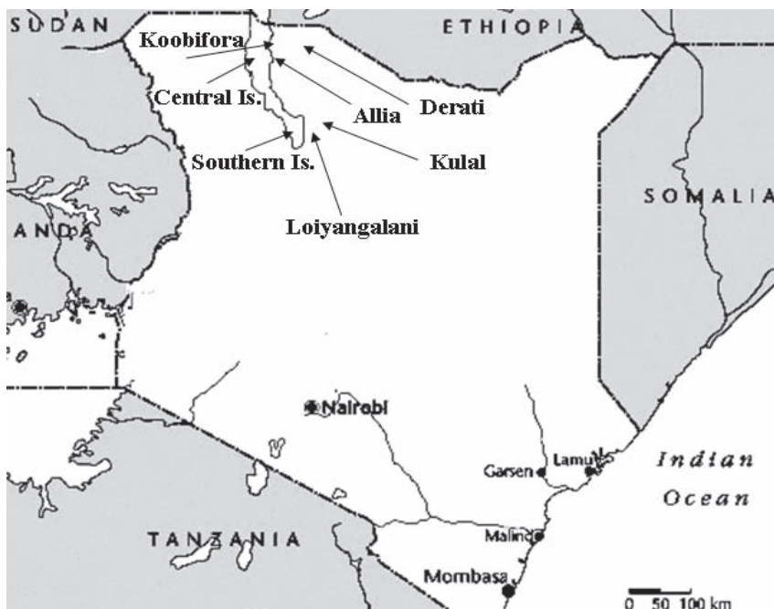
Fig. 1. — Lake Turkana with detail of the seven study sites.

Species identification followed DOLLMAN (1915-1916), MEESTER & SETZER (1971), DELANY (1975), KINGDON (1971-1974a, 1971-1974b, 1997), and was confirmed by comparisons with specimens at the National Museums of Kenya. The nomenclature is based on WILSON & REEDER (2005). Most mammals were released at the capture point, after being marked non-invasively by clipping fur in a unique, recognizable pattern (CAMERON et al. 1997). Each specimen was identified, its sex,