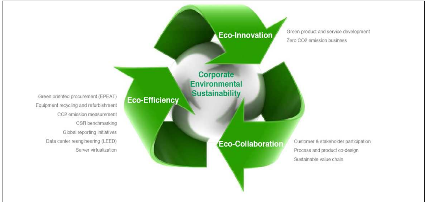
Figure 1. Three-sided Diagram of Green IT in Practitioner Literature

Murugesan's four categories relate to the three-sided diagram from Siggins and Murphy: Green Use and Green Disposal relate to Eco-Efficiency, Green Design relates to Eco-Collaboration, and Green Manufacturing relates to Eco-Innovation. Therefore, these three factors are discussed throughout the practitioner literature, and Table 2 shows this breakdown.