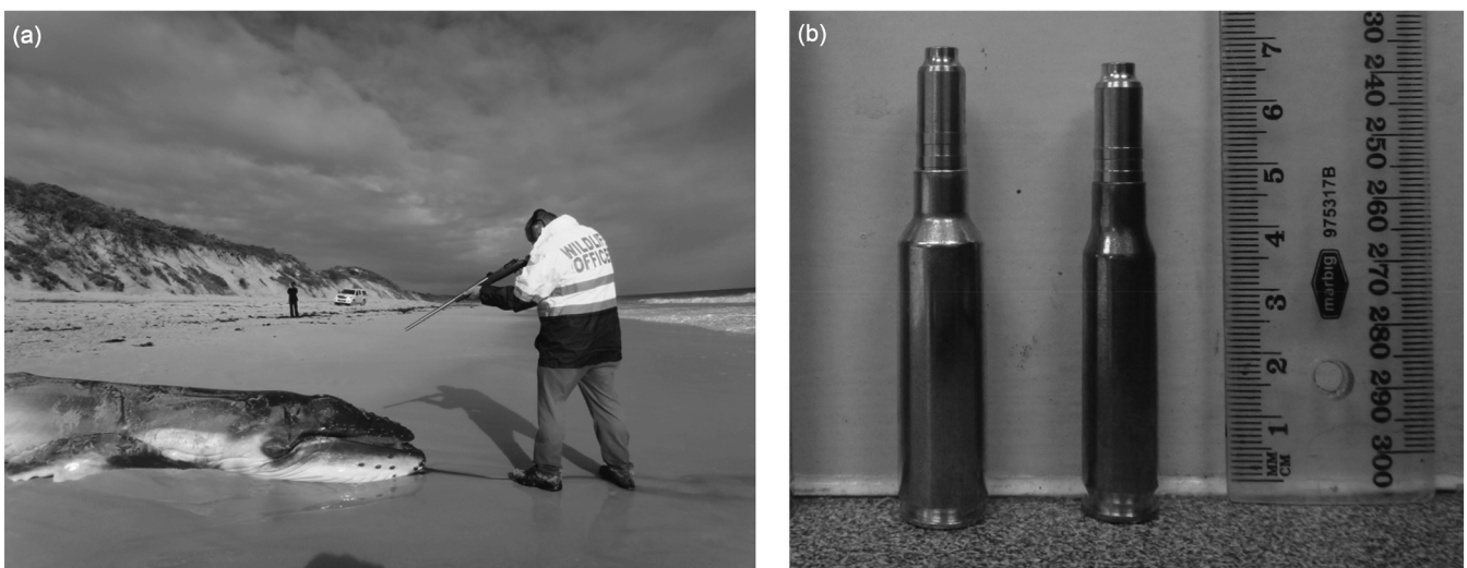
Fig. 1. Standardised shooting methodology used in this study. (a) Standardised shooting technique for post-mortem ballistic testing on a neonate humpback whale ( Megaptera novaeangliae ) in ventral recumbency. (b) The non-traditional design of the .30 calibre blunt solid copper-alloy non-deforming Woodleigh hydrostatic projectiles used for standardised shooting. The shell casings are .300 Winchester Short Magnum (left) and .308 Winchester (right).

All rifles fired the same projectiles; 12g/180 grain Woodleigh hydrostatically stabilised blunt non-deforming solid bullets (Table 1; Fig. 1b). These projectiles are constructed from copper-alloy (see Thomas, 2013) and have been developed to allow deep tissue penetration in large, thick-boned game species. These projectiles were chosen on the basis that blunt-nosed non-deforming projectiles have previously been shown to successfully penetrate cetacean craniums (Øen and Knudsen, 2007) while shotgun solids,