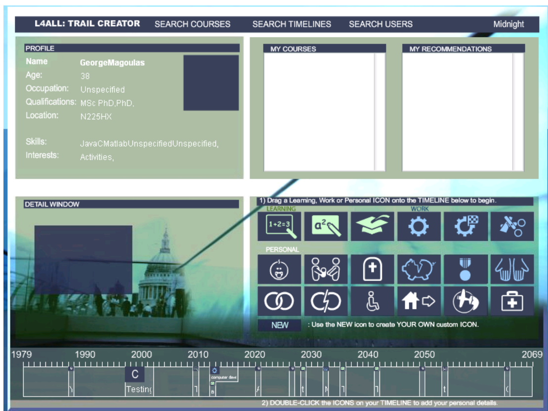
Figure 1. User interface for timeline creation.

At the very bottom of the screen, the user timeline is represented as a stripe with the years annotated on the top of it. The user can choose to create a new episode for the timeline from the range of icons or from the results from a courses search (see below). The new episode can be placed on the timeline by simply dragging and dropping it onto the timeline. When dropping onto the timeline, a new dialog box pops up (see Figure 2) for the user to specify the details of the new episode. Saving the new episode in the timeline initiates (transparently to the user) a synchronisation of the visual front-end with the databases at the backend.