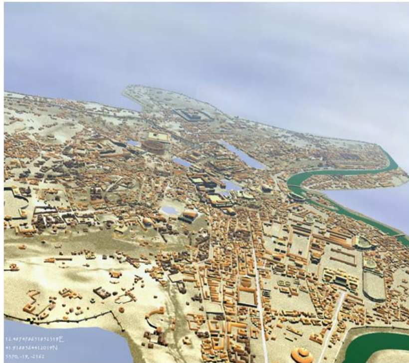
Fig. 2. Real-time rendering of the Rome Reborn model

to the GeoNames integration with Wikipedia ( http://www.geonames.org/ ) to obtain semantically-annotated data in the form of XML in response to input latitudes and longitudes. This is then processed and used as the basis for the construction of Aand minimises unnecessary web traffic generated by multiple queries with identical returns.