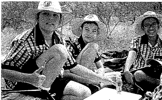
Students conducting pH, salinity and turbidity assessments.