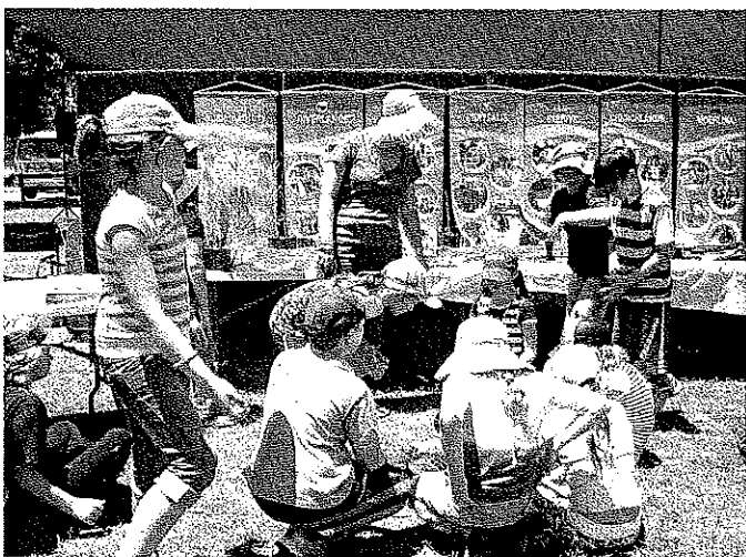
Students at the Groundwater Festival explaining the Healing the Swan project to a teacher.