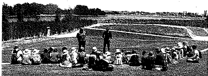
Students, teachers, mentors and scientists discussing the management of the Swan River at the Point Fraser rehabilitation site.