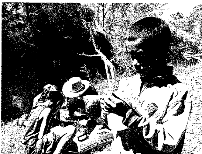
Investigating water temperature.

This teacher feedback provides additional evidence substantiating the claim of improved student knowledge and skills resulting from participation in the Healing the Swan project.