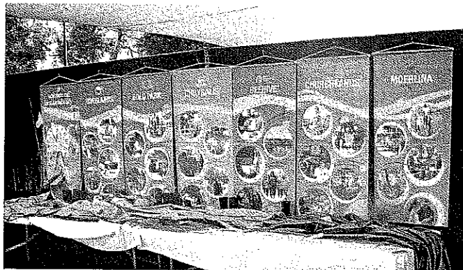
The Groundwater Festival banners showcasing the work of the six schools in the Healing the Swan project.

from tertiary institutions, government and non-government organisations. This was found to positively contribute to student learning. In conclusion, the Healing the Swan project, set in a real life, hands-on context, provided a rich and enjoyable learning experience with deep learning.