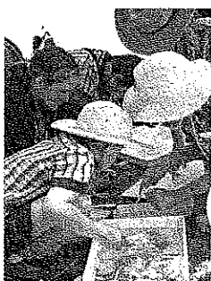
Students examining macroinvertebrates in a sample of river water.