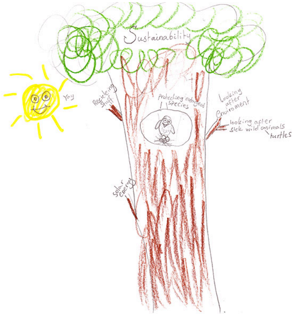
Figure 3: Mind Map of 'Sustainability' by Year 5 Girl

In the Nestwatch project, the students were again encouraged to reflect from a whole systems thinking perspective about interrelated issues impacting on the project. Students observed pollution at the site and considered its origins. They discussed implications of the project findings for the health of the turtles, the ecosystem and people. Students participated in hands-on environmental action with associated discussion of the related values. However, initial evidence suggests that students need more experience in seeing the big picture, establishing interrelationships and understanding phenomena as an integrated whole.