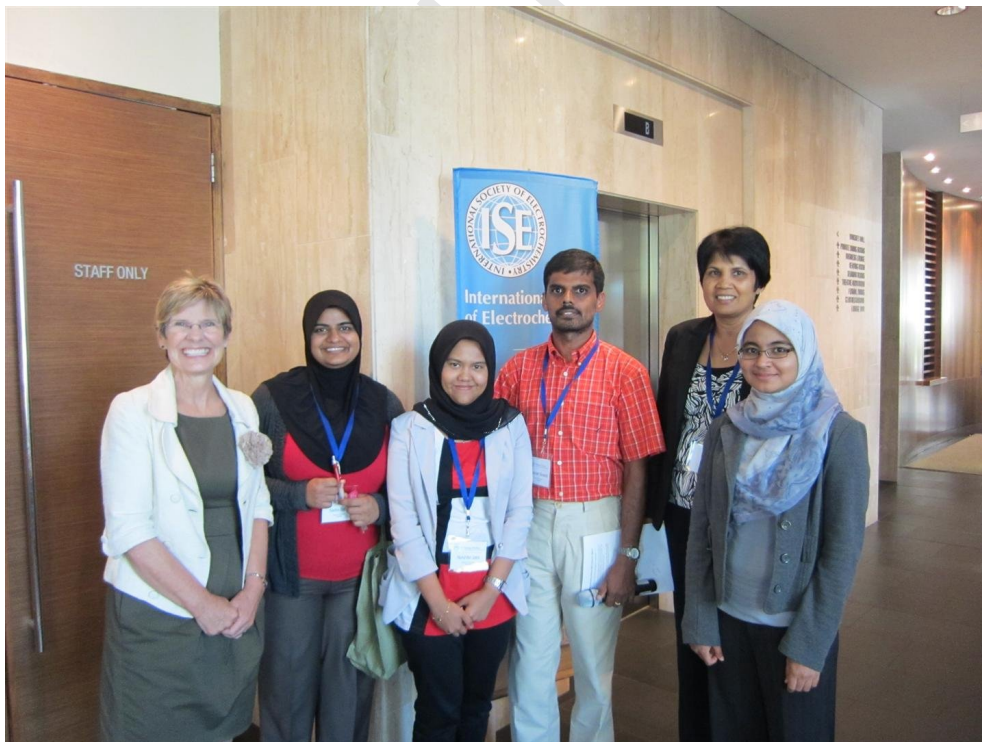
Group Photograph at the Foyer.