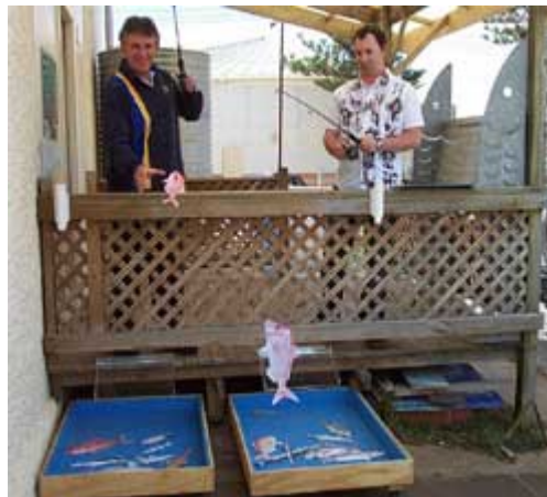
Figure 6 Fishing Interactive Model

The sixth model is the Fishing Interactive model (figure 6), which includes an opportunity to fish and measure your catch. Visitors need to return any undersize fish through the return chutes.