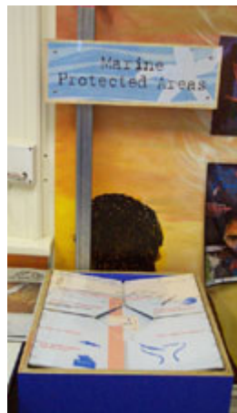
Figure 4 Marine Protected Areas

The fourth model is the Marine Protected Areas model (figure 4), which highlights the Great Australian Bight Marine Park and its various categories of conservation.