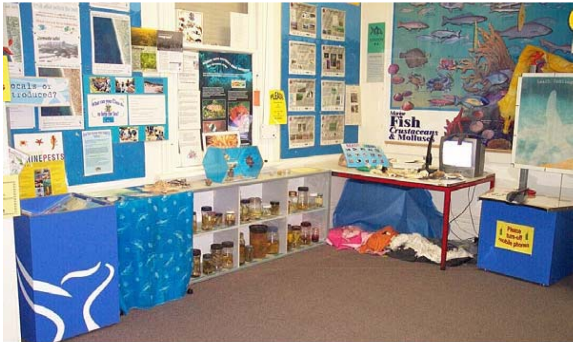
Figure number 7 Specimen Display

The seventh model is a new model; it is a specimen display.