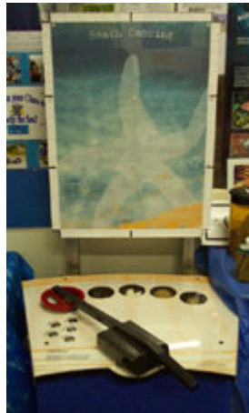
Figure 3 Coastal Birds Model

The third model shown is the Coastal Birds model (figure 3) which features various coastal birds for identification, a visitor can lift up each bird wing for further information.