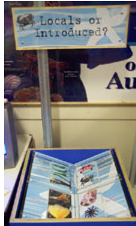
Figure 5 Introduced Species

The fifth model is the Introduced Species Interactive model (figure 5), which requires visitors with making a choice between two similar creatures - one being native and the other introduced. This is used to highlight the similarities of these creatures.