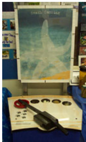
Figure 2 Beachcombing Model

The next model shown is The Beachcombing model (figure 2), which utilises a metal detector so that when it is held over a beachcombing item, e.g. a fibre ball, its corresponding living item, e.g. a seagrass plant, lights up on the display panel.