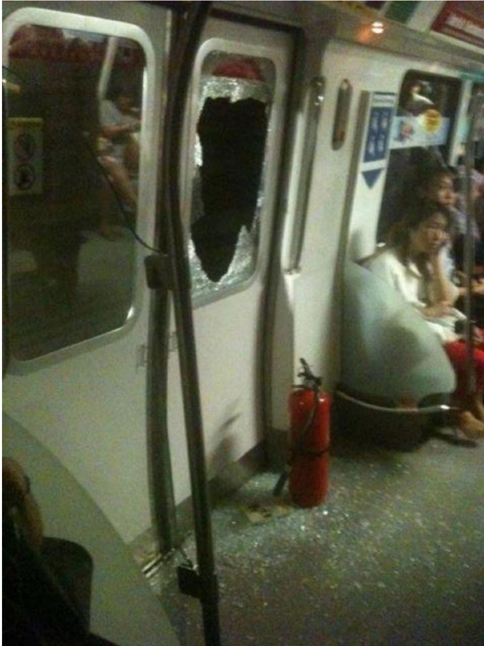
Broken train door window