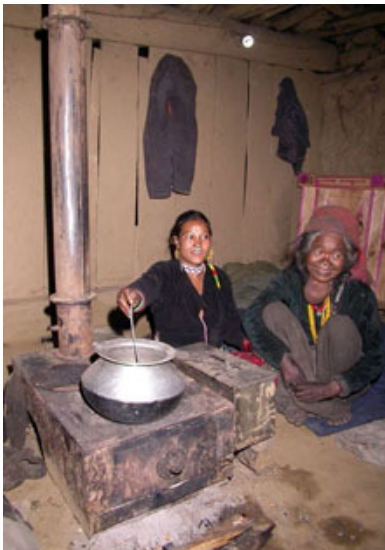
Fig 2: Alongside the efficient smokeless metal stove, designed for the particular local cooking culture and heating needs, also WLED lamps for minimal but locally appropriate, long-lasting light services, are installed in each home, as part of the “Family of 4” HCD concept.

Each of the pieces of equipment that we install is developed locally, bearing in mind the cultural, meteorological, social and economic contexts and the technical limitations of working in this harsh environment. For example, we needed to balance such considerations as the materials available in the villages to build the latrines, accommodating the heating needs and culinary preferences of local people in the design of the smokeless metal stove, the architecture of the houses in the design of the stove pipe, the amount of solar irradiation available in each village considered to be electrified with a solar PV system, and so forth. This level of detailed research, development and customising of technologies is part of what we call “contextualised” technology. It demands significant forethought and long-term commitment to working in the villages, “tweaking” the technologies as new demand or behaviour patterns evolve, and resources to put into baseline needs assessment and follow up research lasting for at least one generation (~10-15 years).