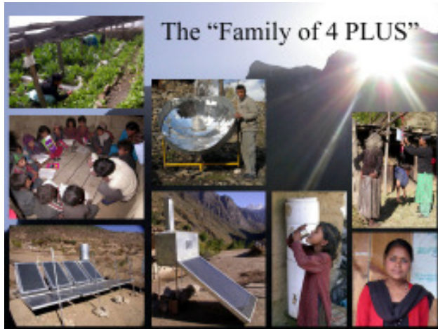
Fig.: 4: “Family of 4 PLUS” HCD concept, 8 additional projects to be implemented according to the local communities’ needs identification.

the “Family of 4 PLUS” program (Figure 4), can be launched. This program includes a wider range of identified needs, which can change from village to village, according to their circumstances and needs.