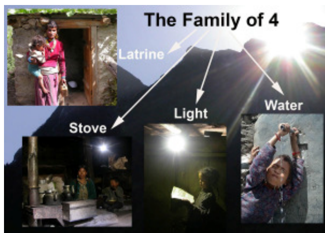
Fig. 1: The “Family of 4” consists of a pit latrine, a smokeless metal stove, elementary indoor lighting for each household and access for each family to clean drinking water from the village based tap stands.

In our time in the villages, we have seen positive synergistic effects of HCD programs, when project components are chosen by villagers based on their needs assessment and when these components dove-tail together to improve the overall hygiene, sanitation and access to elementary energy services in the village. Thus, local context developed RET projects are embedded in long-term HCD activities and preventative health care programs that remove the root causes of poor health conditions. Two major, direct health related benefits, are experienced through RET projects. First, their application and use brings relief from suffering, related to poor living conditions, such as heavy indoor air pollution from open-fire cooking and heating. This enables improved overall health-, and living-conditions, even for people with permanent and incurable health conditions. The second, greater and long-term benefits of RETs, lie in the prevention of a whole range of illnesses and health impairments for the people born into families who already have an HCD implemented.