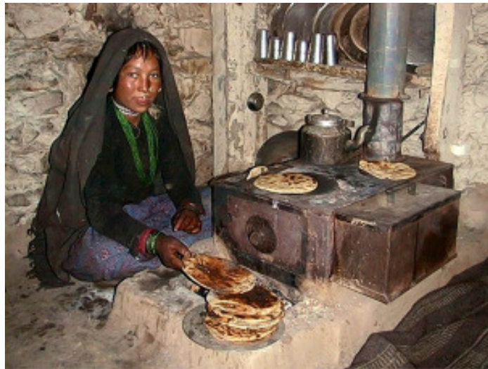
Fig 3: The Smokeless Metal Stove (SMS) which I designed in 1998, has been continually improved. Up to the end of 2010 over 5,000 homes in the remote districts of Nepal have had one installed. It cooks the traditional food “dhal bhat” all at one time and “roti”, uses ~40% less firewood, provides appropriate room heating and 9-litres of hot water for drinking the local “butter tea” as well as facilitating an improvement in personal hygiene. This is called “contextualised” technology, with people, their culture and way of living in the centre and technology developed to suit them in their context.

An example illustrating how important it is to contextualise technologies comes from the development of the smokeless metal stove that we install in the Humla homes. What local people told me that they want is a cooking and heating system that allows them to prepare multiple dishes simultaneously, to produce the national dish called “dal bhat tarkari” (lentils, rice and vegetables) twice a day, whilst also warming the room