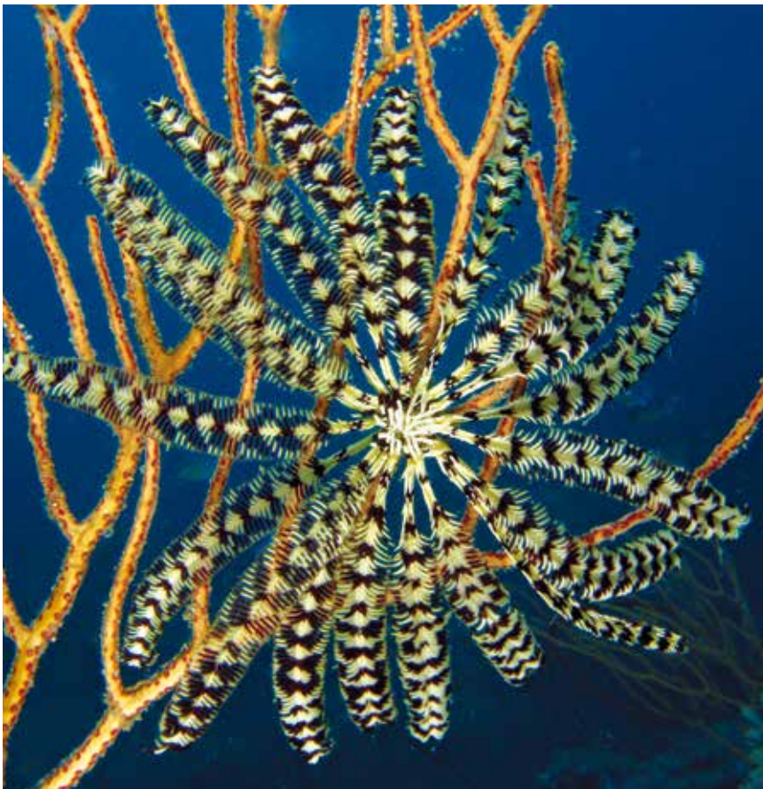
Left A feather star on gorgonian coral.