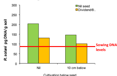
Figure 1. R. solani DNA soil levels at anthesis sampling compared with levels at sowing for plots with treatments of seed dressing with Dividend® (+/-) and cultivation 10 cm below seed (+/-).

highest rate compared to untreated plots. At the two highest rates there was a significant increase in yield of 0.16 and 0.26 t/ha compared to the untreated Nil. The new fungicide shows some promise to reduce disease and improve yield.