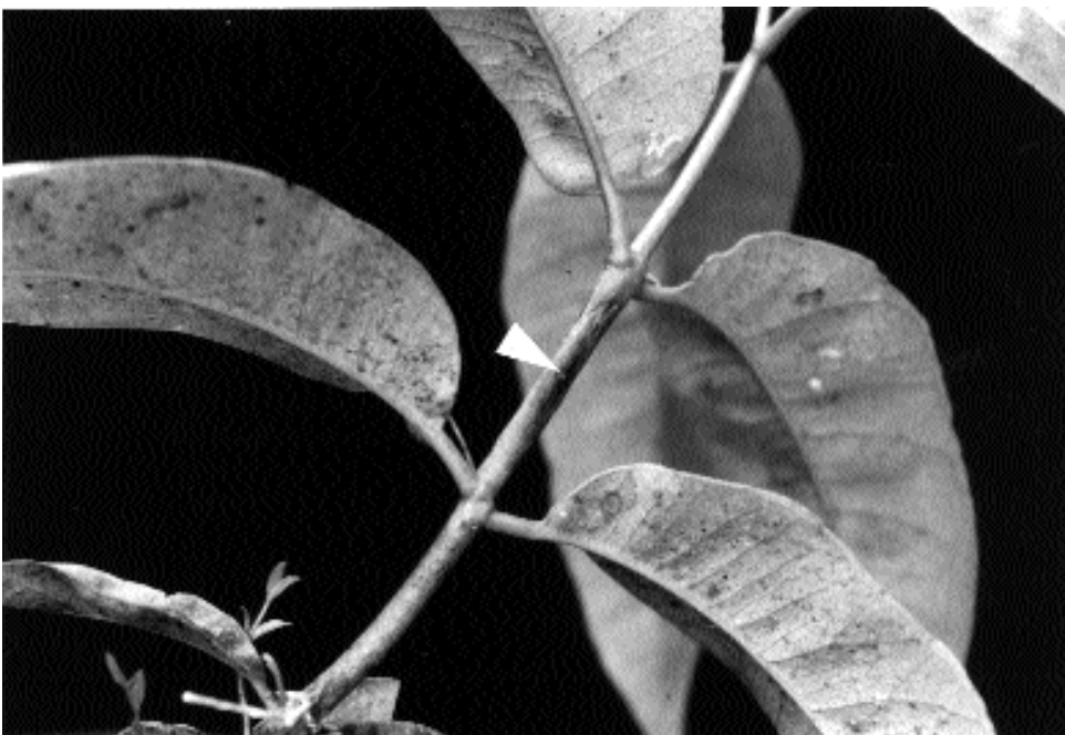
Fig.2. Typical woody appearance of a lesion 28 days after stem inoculation of a jarrah seedling with Phytophthora cinnamomi . Arrow indicates point of inoculation.

Tangential spread of lesions was observed in all plants, ranging from 90° to fully girdled (360°), but was not significantly different ( P > 0.05 ) between families infected with the same Phytophthora species, at 21 or 42 days after inoculation. Within families, mean tangential spread of lesions caused by the three Phytophthora species was also not significantly different, although it was generally greatest in plants inoculated with P. citricola .