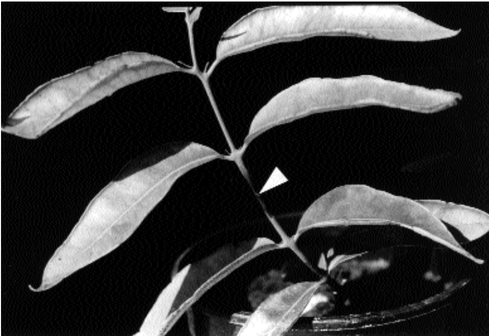
Fig.1. Typical lesion caused by Phytophthora cryptogea 14 days after stem inoculation of a jarrah seedling from a half-sib family susceptible to P. cinnamomi . Arrow indicates point of inoculation.