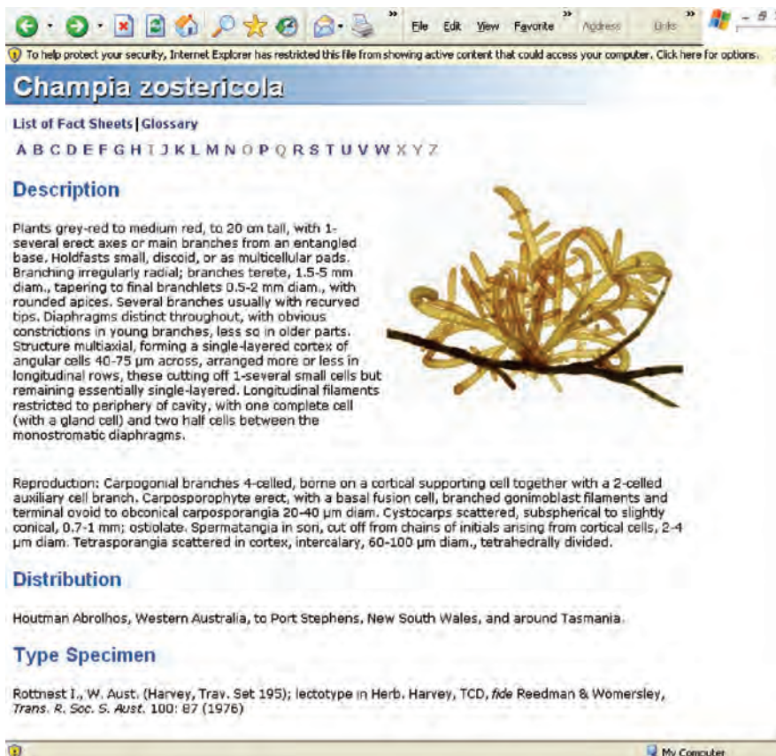
Figure 4.11: Example Screen from Species Fact Sheets